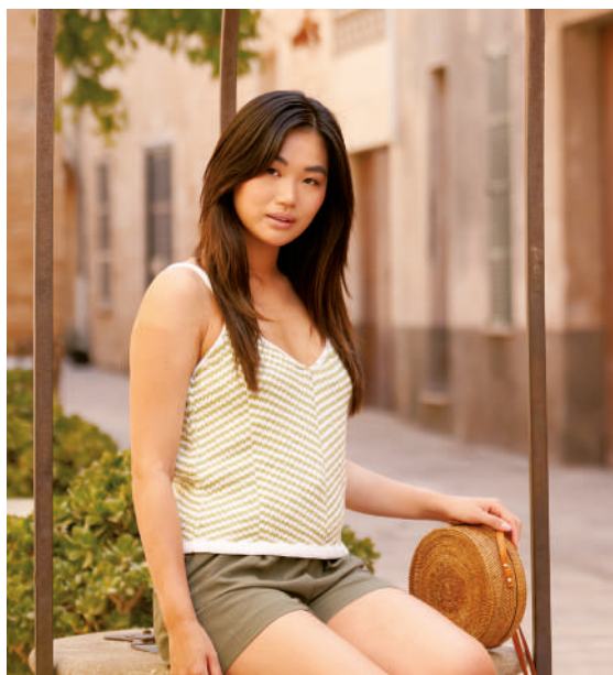
Sample size 81-86 cm (32-34")