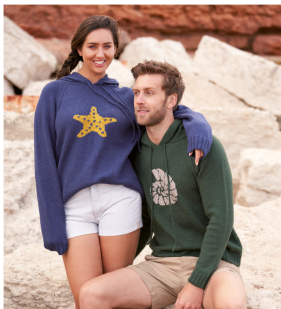
Sample size 102-107 cm (40-42")