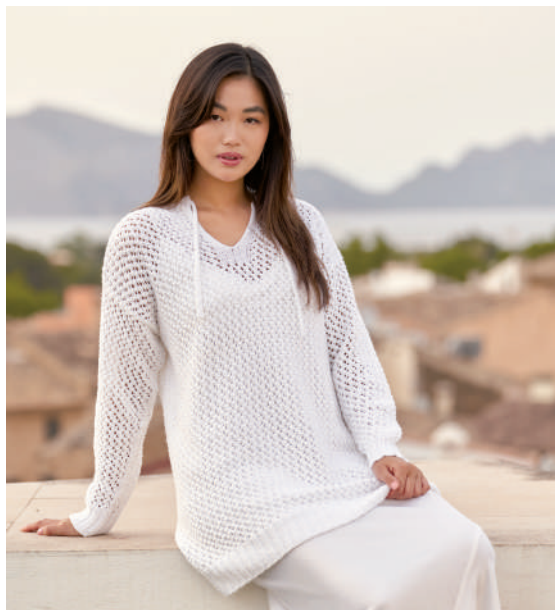
Sample size 81-86 cm (32-34")