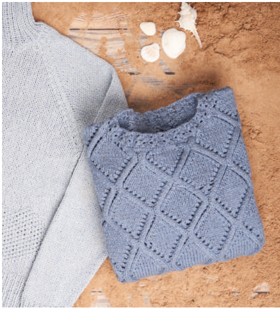
Sample size 11-12 years