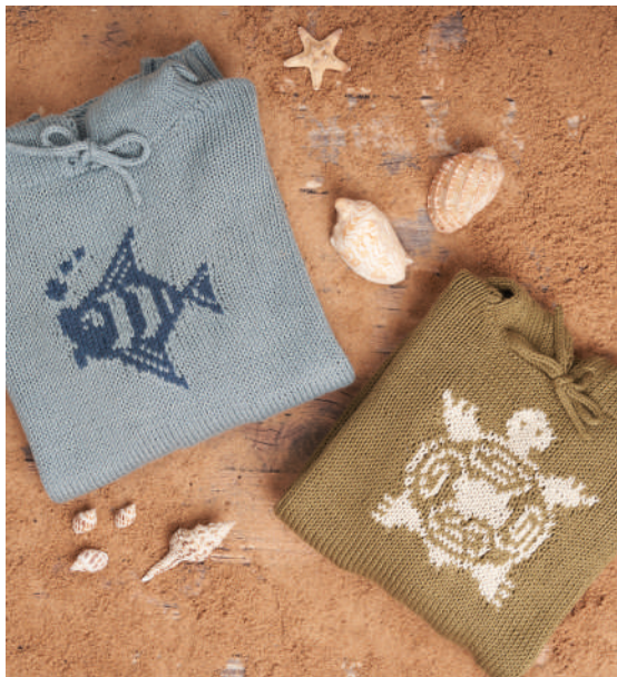
Sample size 7-8 years and 11-12 years