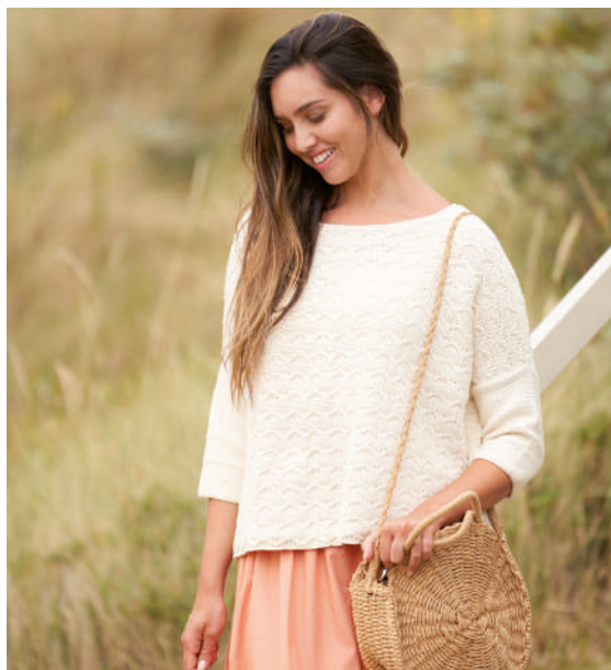
Sample size 91-97 cm (36-38")