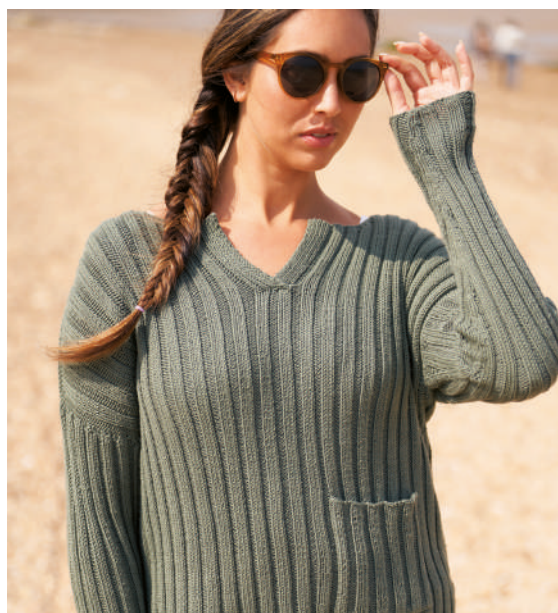
Sample size 91-97 cm (36-38")