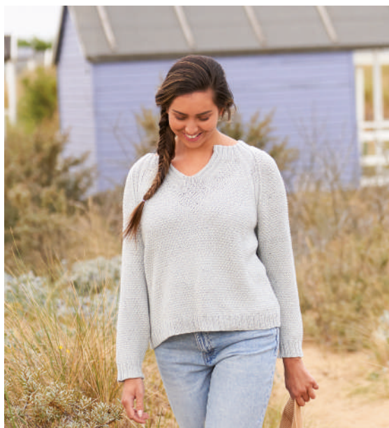
Sample size 91-97 cm (36-38")