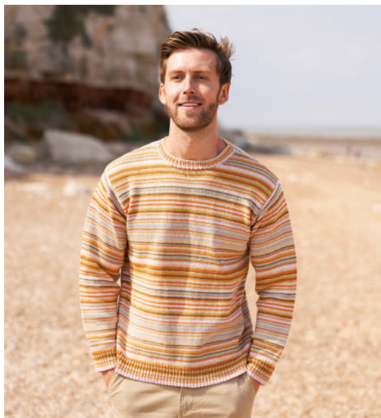
Sample size 102-107 cm (40-42")