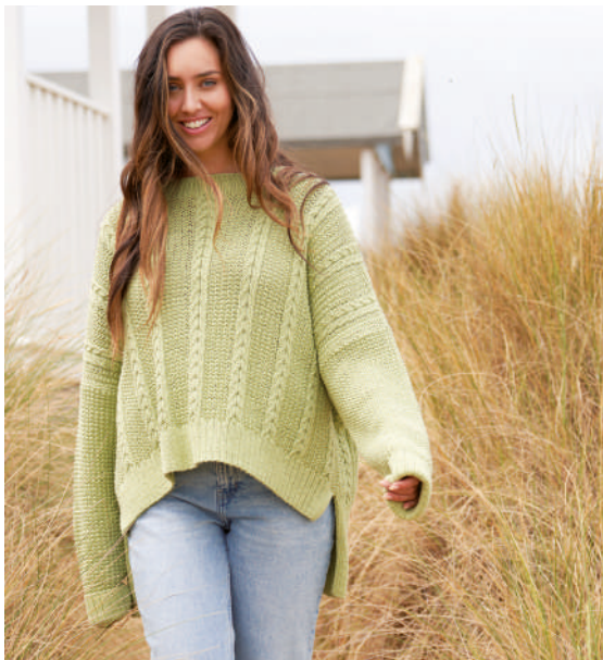
Sample size 91-97 cm (36-38")