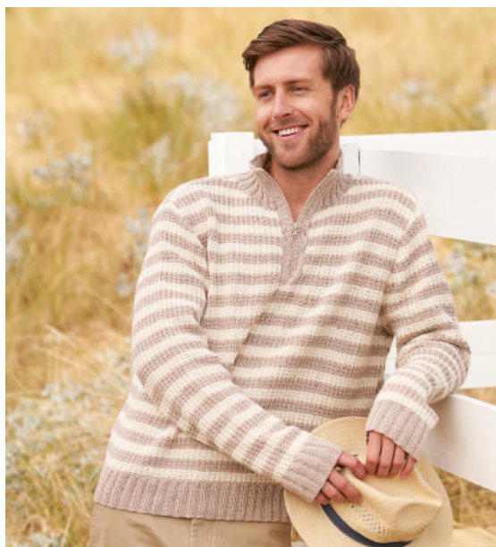
Sample size 102–107 cm (40–42")