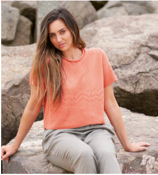
Sample size 91-97 cm (36-38")