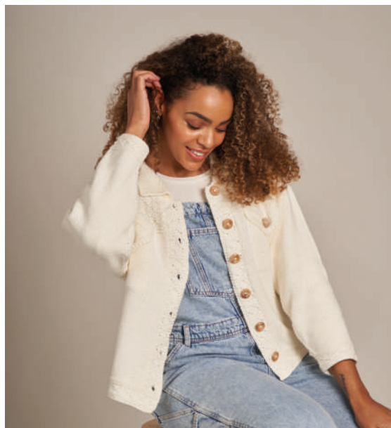
Sample size 32-34" (81-86cm)