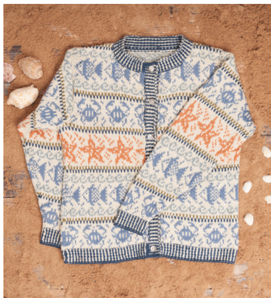
Sample size 11-12 years