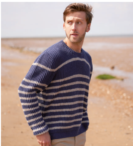
Sample size 102-107 cm (40-42")