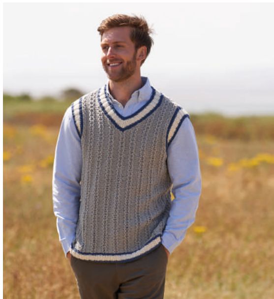
Sample size 102-107 cm (40-42")