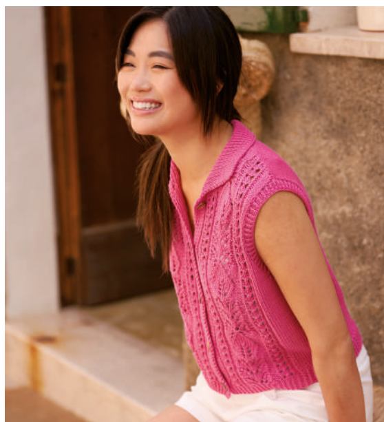
Sample size 81-86 cm (32-34")