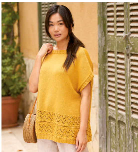
Sample size 81-86 cm (32-34")