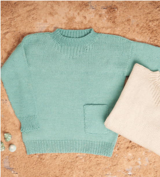
Sample size 7-8 years and 11-12 years