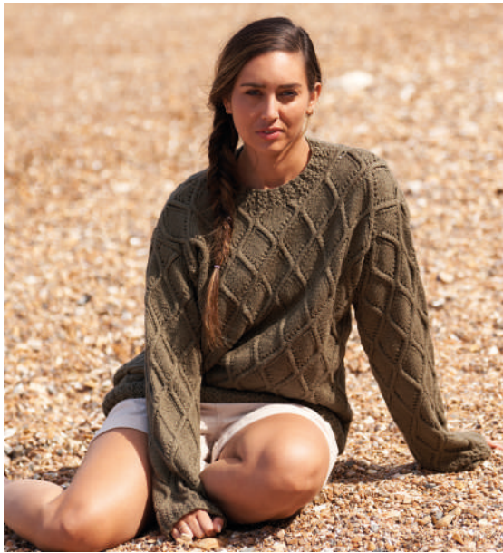
Sample size 102-107 cm (40-42")