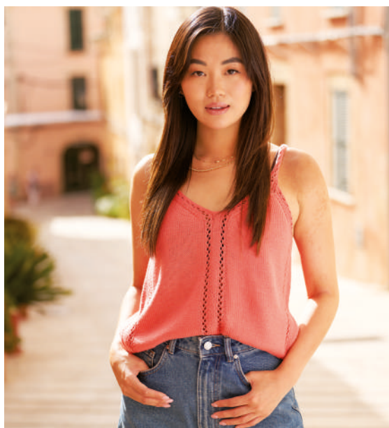
Sample size 81-86 cm (32-34")