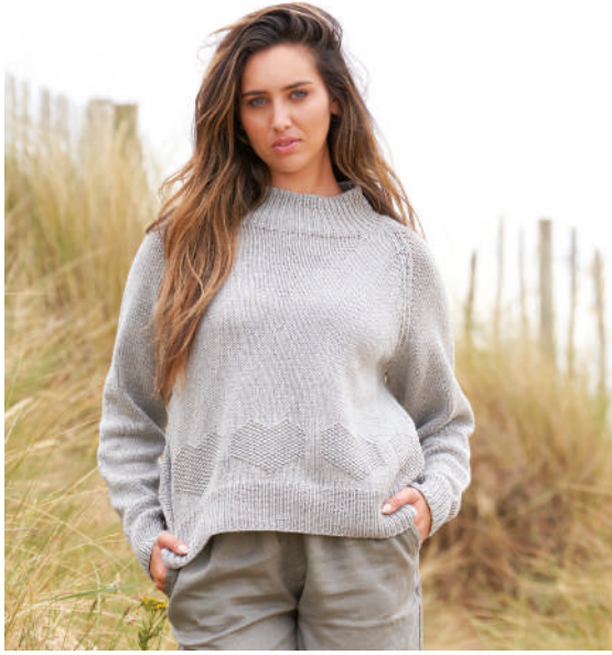
Sample size 91-97 cm (36-38")