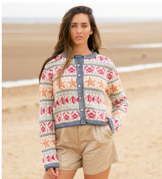
Sample size 91-97 cm (36-38")