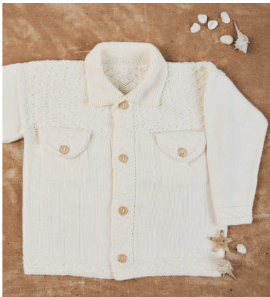
Sample size 7-8 years