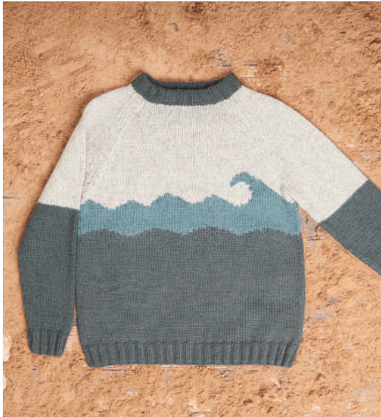
Sample size 7-8 years