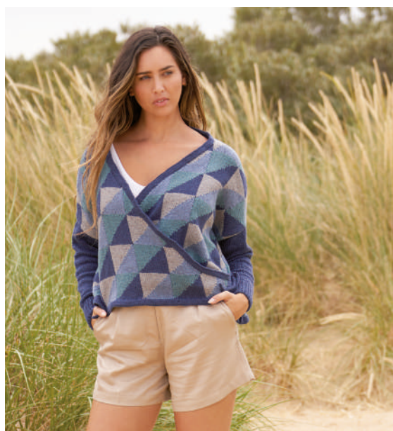
Sample size 91-97 cm (36-38")