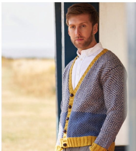
Sample size 102-107 cm (40-42")