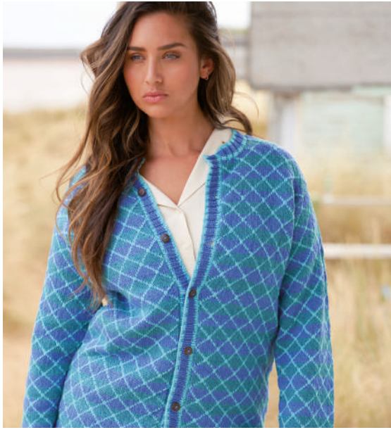
Sample size 102-107 cm (40-42")